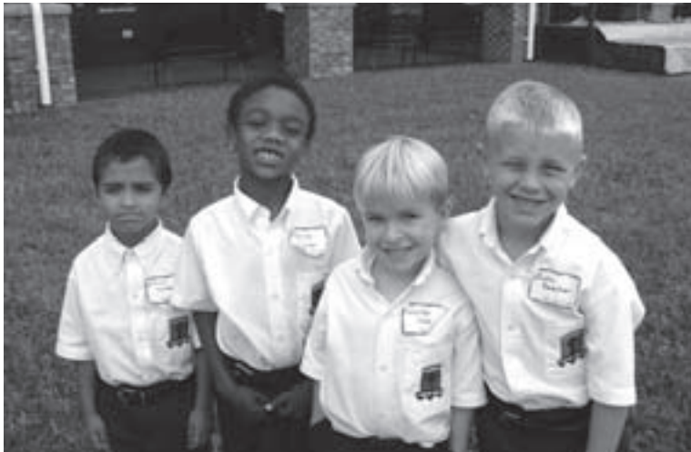
Los estudiantes de las escuelas católicas reciben entrenamiento académico de calidad y formación en la fe enraizada en las tradiciones y en los valores católicos.

con Cristo y asegurarnos de que otras parroquias, otras escuelas y otros ministerios también respondan a las demandas del crecimiento en nuestra área”. ■