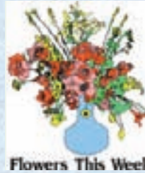
Flowers This Week

If you would like to place flowers in the church in memory of a loved one, or in honor of someone or an event, please contact the parish office.